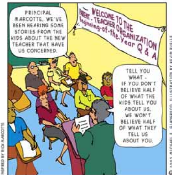
PARENTS AND TEACHERS MEET HALFWAY.