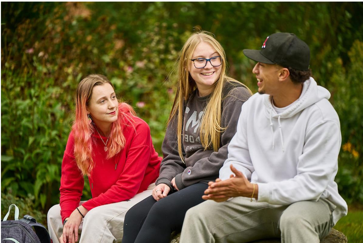
Current students gathering in the Teaching Gardens