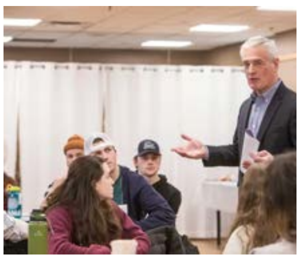
Calling All Alumni! (you too, 2023!)

Did you know that by sharing your job title and industry with the college, you help prospective Purple Knights decide to come